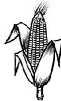
MAIZE 2. People's Party of Arunachal