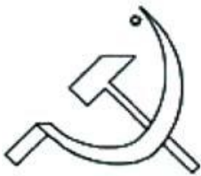
HAMMER SICKLE & STAR 4. Communist Party of India (Marxist)