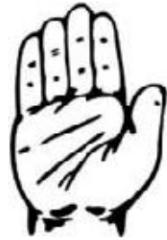
HAND 5. Indian National Congress