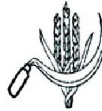
EARS OF CORN & SICKLE 3. Communist Party of India