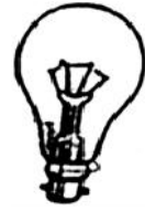
3. ELECTRIC BULB