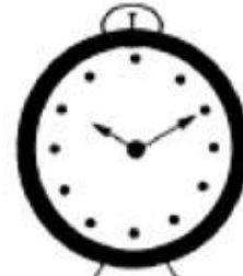
CLOCK 6. Nationalist Congress Party