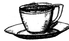
15. CUP & SAUCER