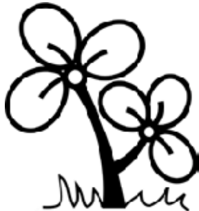
FLOWERS & GRASS 1. All India Trinamool Congress